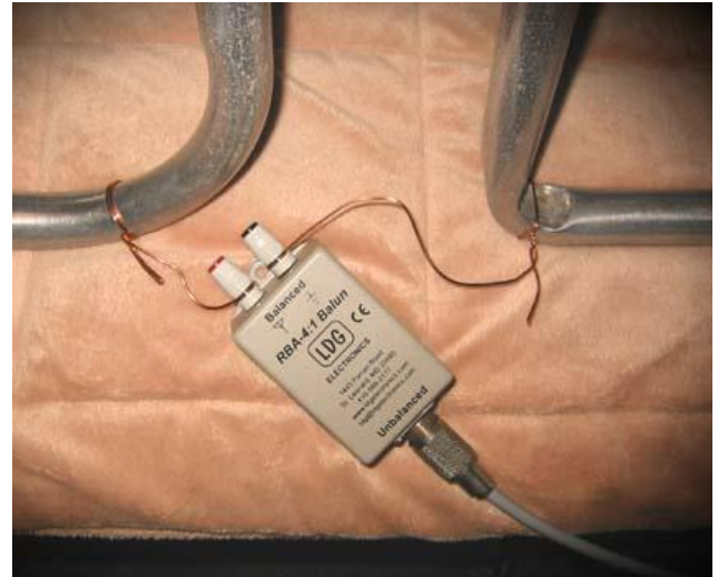
Feed Point of the Lawn Antenna