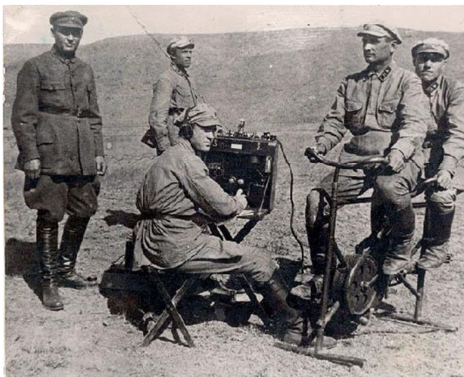
Обеспечение питанием радиостанции в полевых условиях.

41 Description of Patent of a Patent for Antenna for Mobile Communications. 98- 100