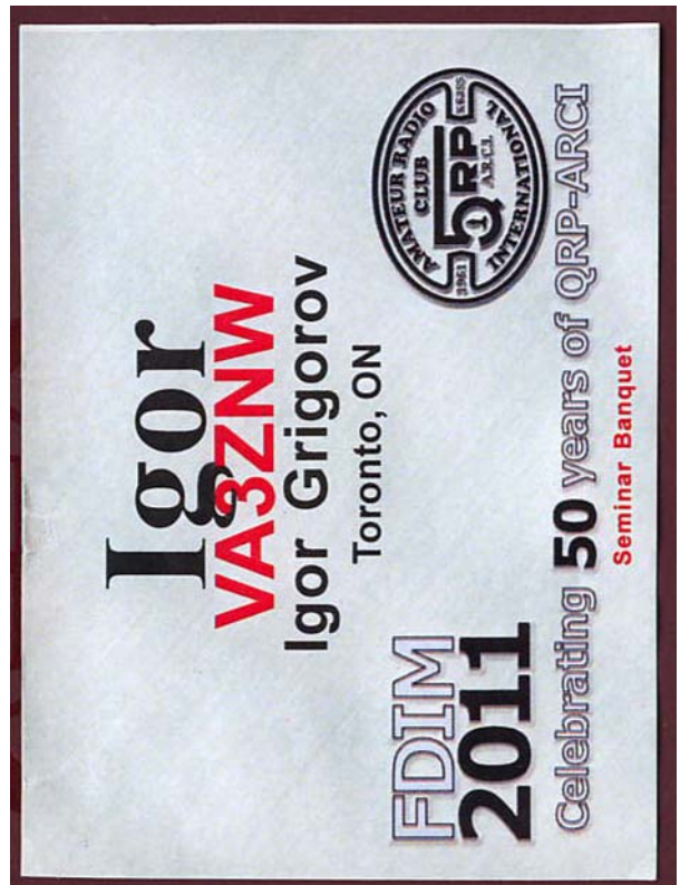
FDIM- 2011 TICKET