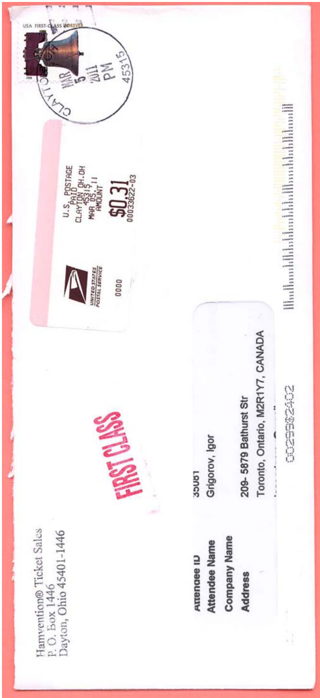
LETTER with HAMVENTION- 2011 TICKET