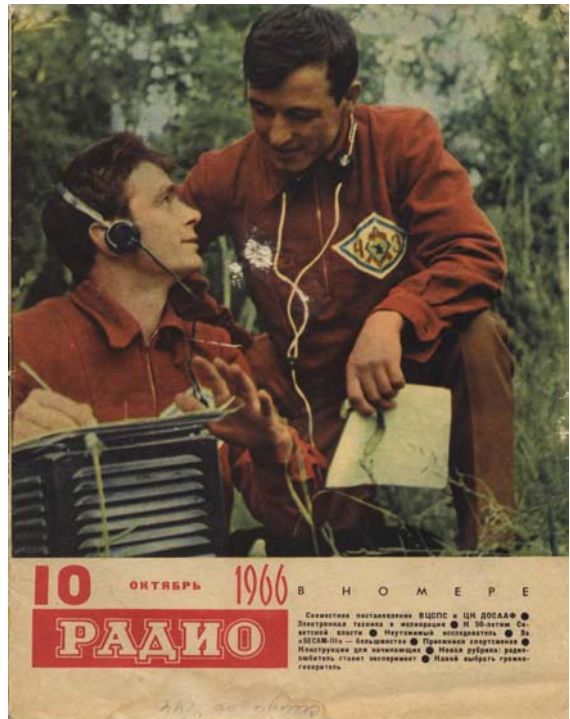
Front Cover Magazine “Radio” # 10, 1966

It is a dipole, halves of the dipole is a copper rod in diameter 6- mm (3- AWG). Above the rod a plastic tube in diameter 36- mm (1-1/2 – inch) is placed. The tube is filled by iron sawdust. The length of the plastic tube is 2/3 from the length of the copper rod. Figure 1 shows the antenna.