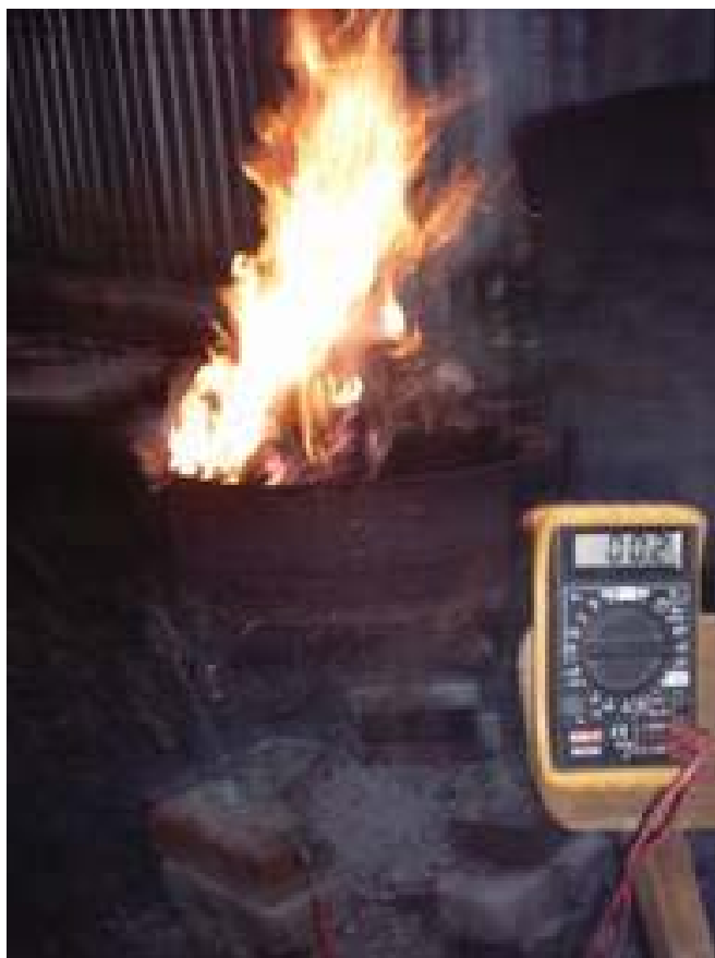
Picture 1 Typical Fire

The experiment was made 5 times at different days. Were received very stable data. Current was zero at no fire. When the fire was burning, the current slowly increased up to + 7 nano Amperes (at fire shown at Picture 1 ). Ever weak wind destroys the ionic column and decreased the current from the fire.