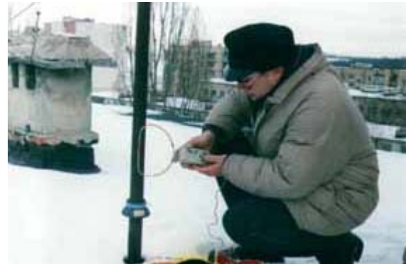
Photo: Finding of resonance of the antenna mast with the ferrite core at its base with help a GDO

Unfortunately, when the ferrite ring was installed, a resonance on a range of 15-M appeared at the mast. TV interferences appeared too. For elimination of this resonance I used a magnetic tape from an old videocassette. When I wound the centre of the mast with the tape, my GDO did not fix any resonance on amateur ranges. By means of an old magnetic tape from old videocassettes it is possible to eliminate easily parasitic resonances of masts and guys on high-frequency amateur ranges of 15-6 meters