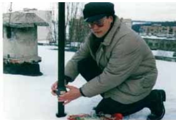
Photo: Ferrite core installed at the antenna mast base

For example, a metal mast with television antennas was near my transmitting antenna. There were strong TV interferences when my transceiver worked to transfer at a range of 30-M. As it appeared, this mast had a resonance frequency 10100 kHz, or on the amateur range of 30 30-M. When a ferrite ring from a deflection system of an old TV was installed at the base of the mast, the resonance frequency of the mast became equal to 9800 kHz. TV interferences disappeared when my transceiver worked on the 30-M range.