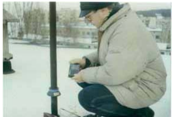
Photo: Finding of the interferences

After that proceed with searching of the exact places where interferences are formed.