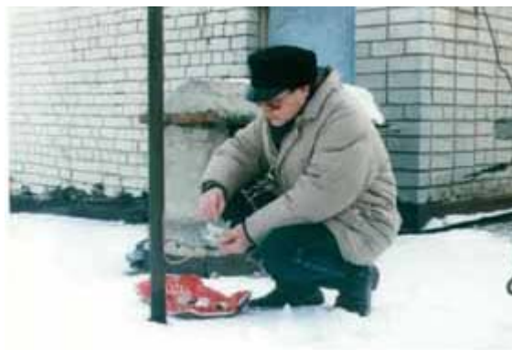
Photo: Finding of resonance of the mast with help a GDO

If metal objects have resonances within operational ranges of a ham's transceiver, significant RF currents can flow on surfaces of these metal objects when the transceiver works to transfer. When significant RF currents flow on surfaces of objects that have sites keeping nonlinear conductivity, these objects will work like a mixer or a multiplier of radio signals. In this case, radio signals emitted by ham's transceiver, can be in different combinations mixed with radio signals from a television center or from VHF broadcast or service stations, with main buzz of 50 (60) Hz, or multiplied by each other. My experience shows that a pressing junction of such resonance objects produces a very high level of interferences.