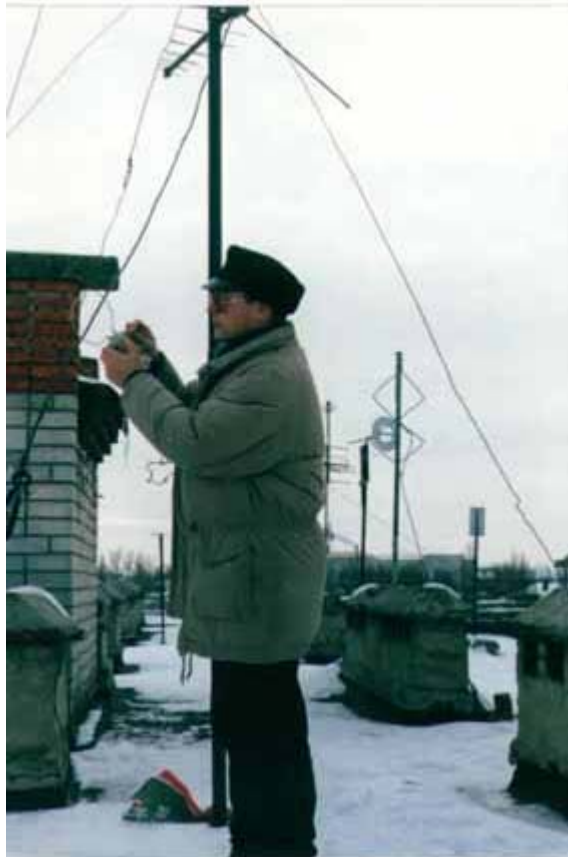
Photo: Finding of resonance of the guys with help a GDO

If to change the resonance frequencies of these objects, a level of the RF currents, caused by work of the antenna to transfer, will be sharply decreased. In this case the level of the interferences will be considerably decreased too, or the interferences will disappear entirely. It is possible very simply to change a resonance frequency of a metal mast (to shift it downwards), if at its base to install a ferrite ring from a deflection system of a TV.