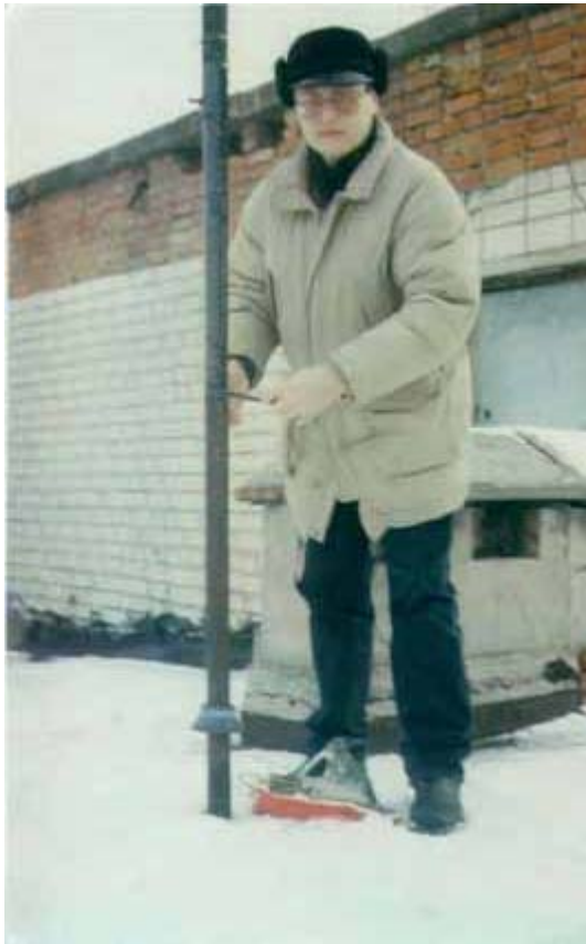
Photo: Wrapping the antenna mast by magnetic tape

Try to find places where the interferences are formed by an indicator of interferences.