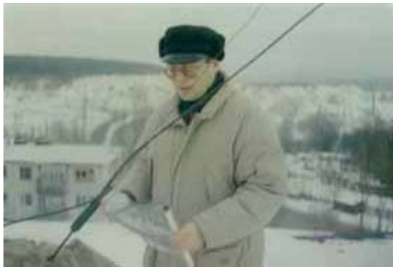
Photo: Wrapping a suspicious place by aluminum foil

It is possible to rub the places with graphite or coal if a ham has no graphite or coal paint. What is the effect of rubbing metal objects or parts of these objects, keeping the effect of nonlinear conductivity, with graphite or coal paint?